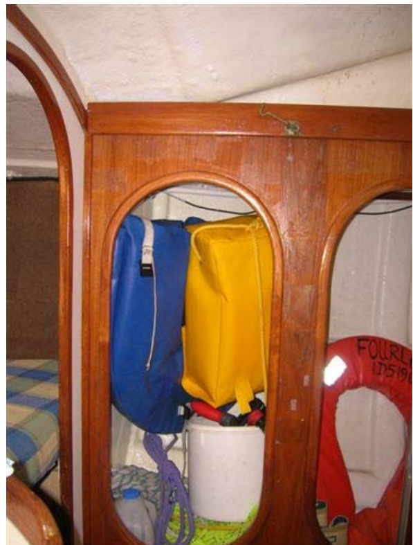
User friendly head with wash basin and lockers – Hanging lockers opposite