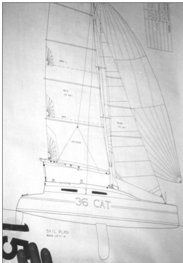
PAWING over the plans

It didn't take long to make the decision but it took a while for the plans to come through. I waited, very impatiently and very