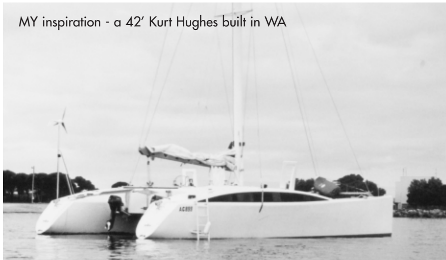
MY inspiration - a 42' Kurt Hughes built in WA

At this point I should add that there was no stauncher "Mono man" than me to be found anywhere. Multihulls, weird things, not seaworthy, capsize, blah blah. I'm sure you've heard it all before. However, I have always had an underlying belief that a good seaman can take an eggshell around the world, with a little luck tossed in, and a bad seaman will run the Titanic onto a frozen brick first trip out. With this in mind I started to think about just what it is that makes