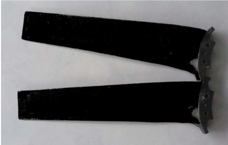
Ampair 100 blades Length – 380mm Weight about 195 grams each.