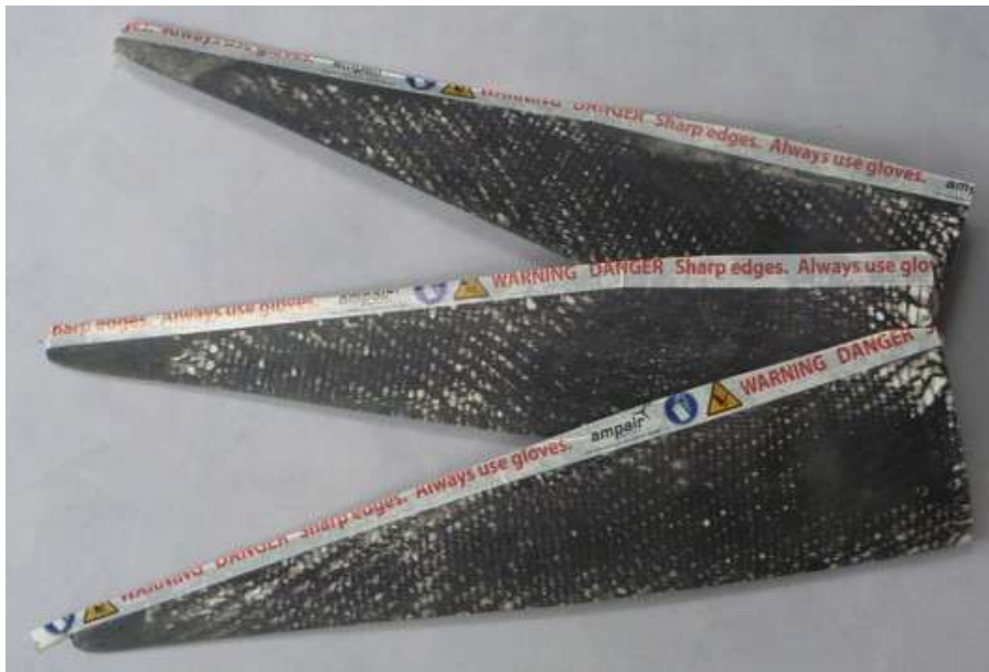
Ampair 300 blades Length – 550mm Weight – 314 grams each

It's no wonder we have only an occasional demand for spare Ampair blades, in fact I have yet to sell set of A300 blades.